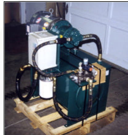
Hydraulic System for Grizzly Lift

Westpro Equipment Company Suite 200 – 1200 North Federal Highway Boca Raton, FL 33432 Tel: (561) 395-6955 Fax: (561) 395-7760 Toll Free: 1-877-WESTPRO (937-8776) Email: sales@westproequipment.com