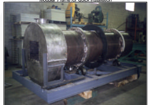
3' Diameter x 10' Long Agglomerator

Westpro Equipment Company Suite 200 – 1200 North Federal Highway Boca Raton, FL 33432 Tel: (561) 395-6955 Fax: (561) 395-7760 Toll Free: 1-877-WESTPRO (937-8776) Email: sales@westproequipment.com